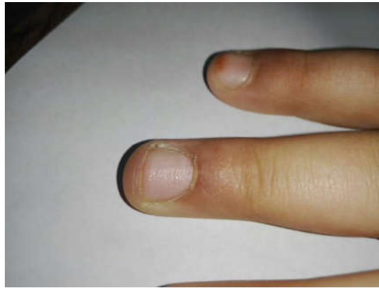
Figure 1: Pitting

The most commonly observed nail changes were pitting (figure 1) in 38 patients (54.2%) followed by trachyonychia (figure 2) in 15 patients (21.4%). The frequency of nail changes is demonstrated in figure 3.