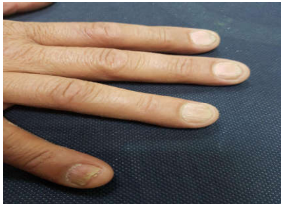
Figure 2: Trachyonychia